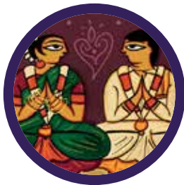
Folk Art Invitations