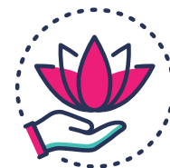
INDIAN FOLK ART