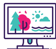
ART + DESIGN SOFTWARES