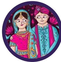
Tailor Made Invitations