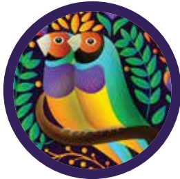
Polish Folk Art