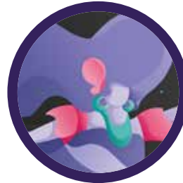
European Art Deco